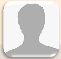
Pavlina Gospodinova SZREDA, Bulgaria