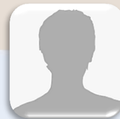
Ognian Zlatev Representative of the European Commission