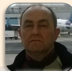
Nikola Municipality of Stara Zagora, Bulgaria